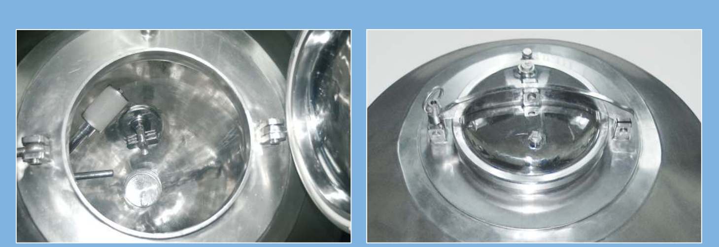
Knife edge chopper blades and the vacuum filter