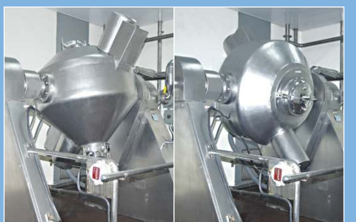
Ideal drying solution for Toxic Materials.