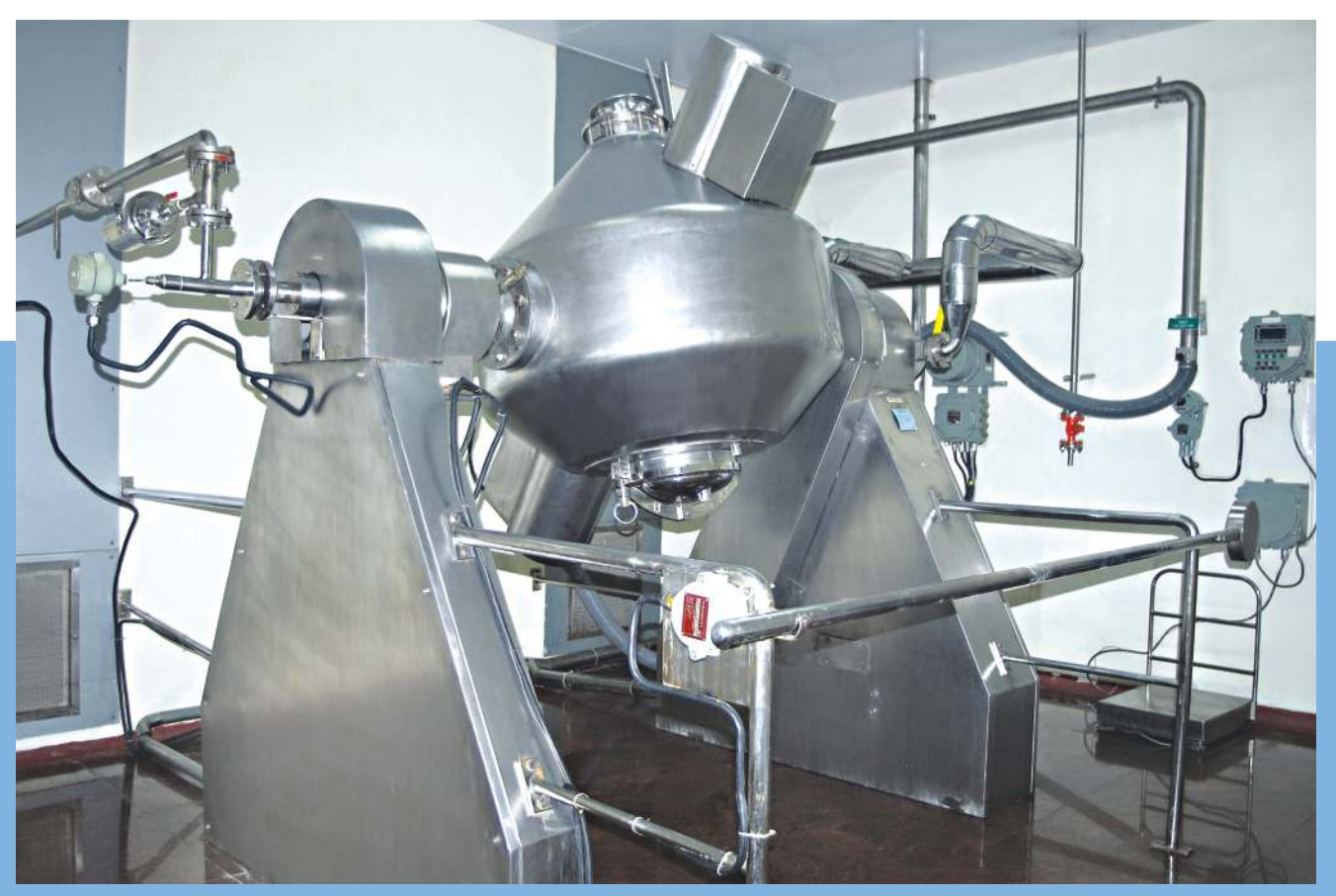
400 Ltrs. RCVD with 2 nos. choppers.

The Roto Cone Dryer with improved technology integrates drying operation under vacuum. The Roto Cone Dryer facilitates enhanced drying efficiency, low temperature operation and economy of process by total solvent recovery. It helps cGMP - based working by achieving optimum dust control, while offering the advantage of efficient charging and discharging of materials. The dryer is also available with an optional thermal medium system.